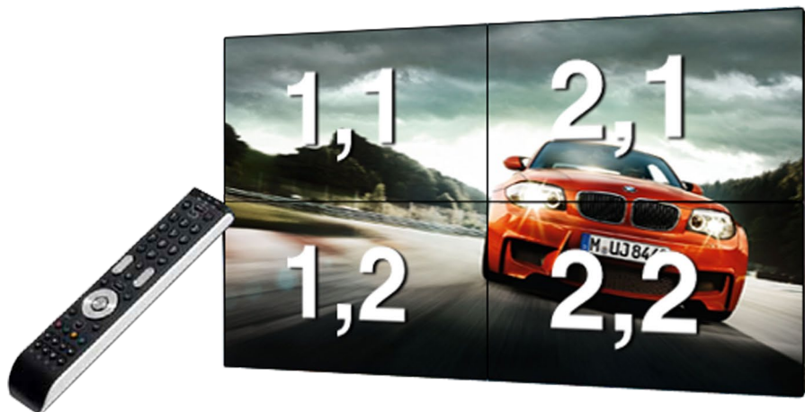
SCREEN TILING FUNCTION

These displays feature a wide range of inputs making it easy to connect your media source to the video wall..