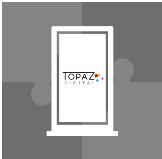
The TOPAZ Outdoor Solution

High impact screens designed to house a small format media player of your choice you can now expand your network to external locations. Our commercial grade displays are IP65 rated and enable you to ensure your message is seen even in the brightest conditions with the ultra-high bright panels which are 5 times brighter than our indoor screens